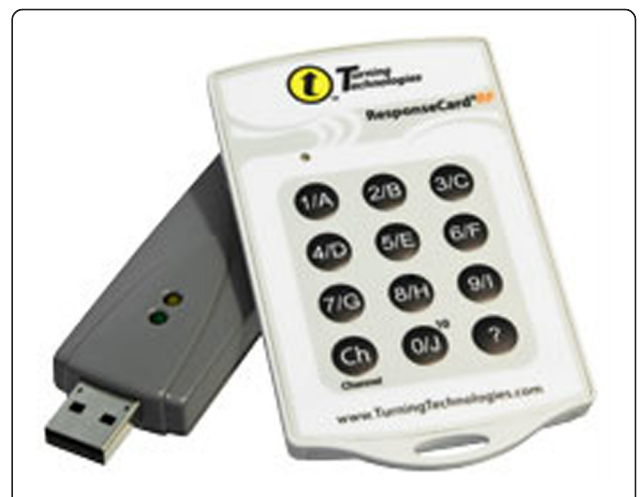
Fig. 1 Photo of a 'clicker' as part of the audience response system hardware

The personal wireless 'clicker' allowed individuals to make a choice from several options, with their choices logged directly onto a computer.